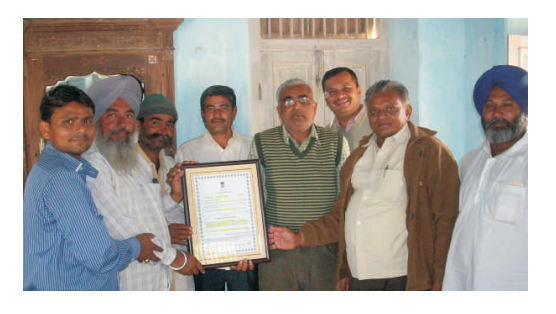
Registration day of Producer Company