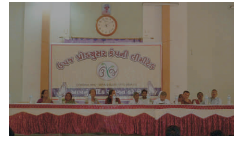
First Annual Meeting of Producer Company